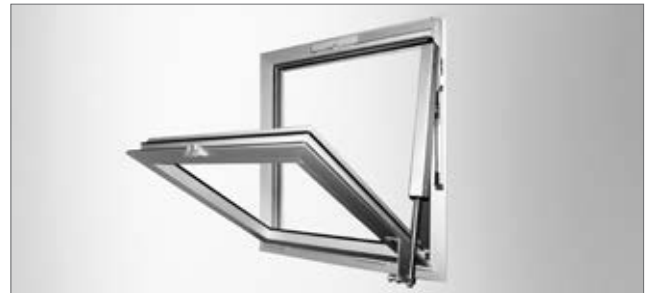
RWA 100 NT