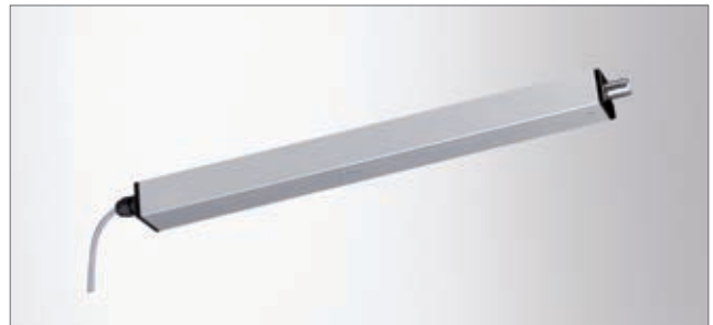
E 250 NT