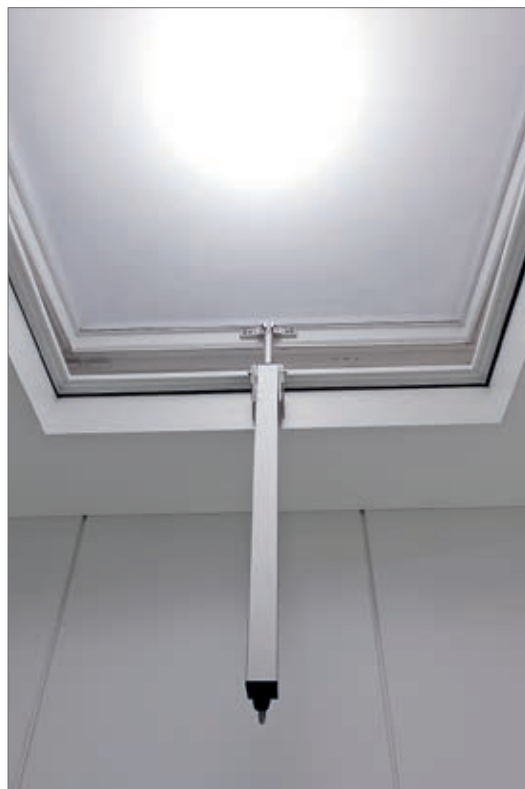
GEZE E 250 NT