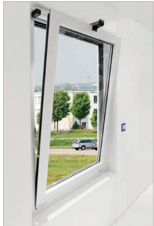
GEZE Powerchain with safety scissors