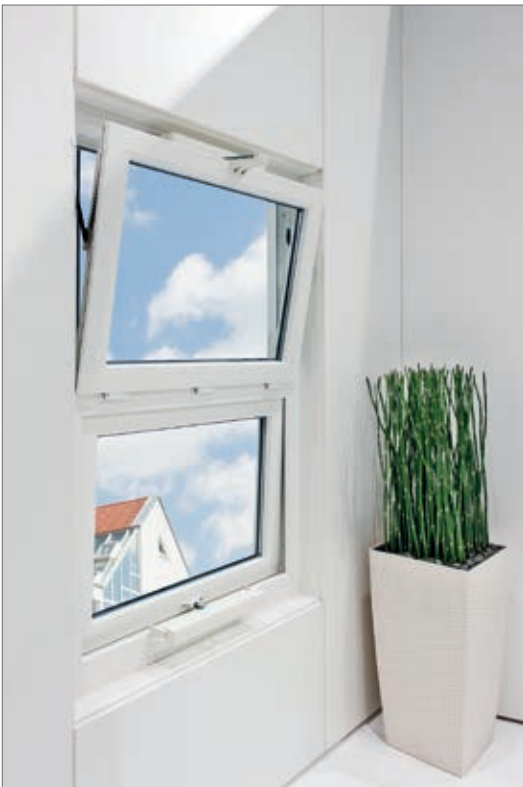
GEZE ECchain with safety scissors