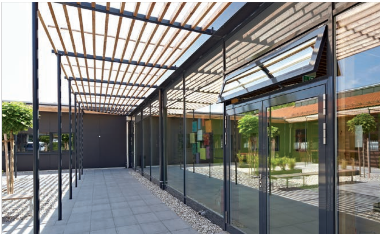
GEZE OL 90 top-hung, outward opening, Stiftung Ecksberg, Mühlendorf, Germany