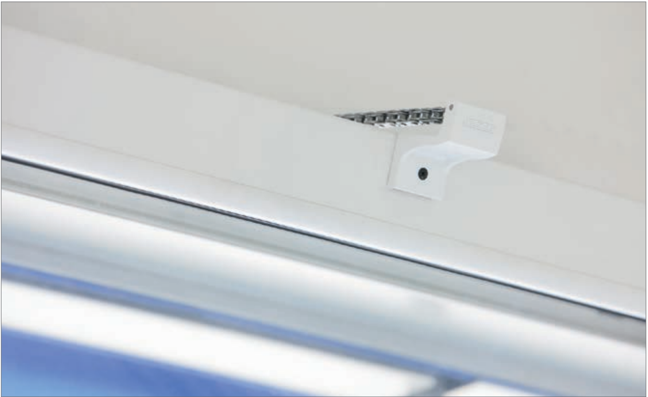
GEZE Slimchain