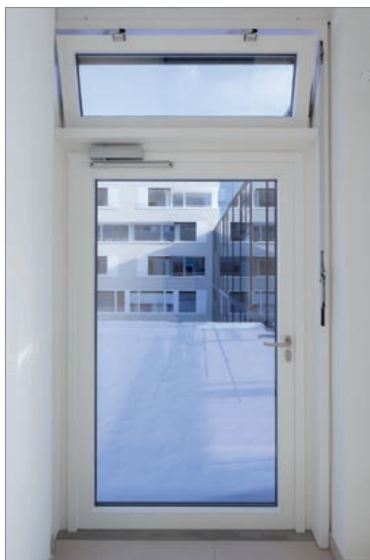
GEZE TS 5000 and OL 90 N with post-rail transmission, Nursing home Augustinum, Stuttgart, Germany