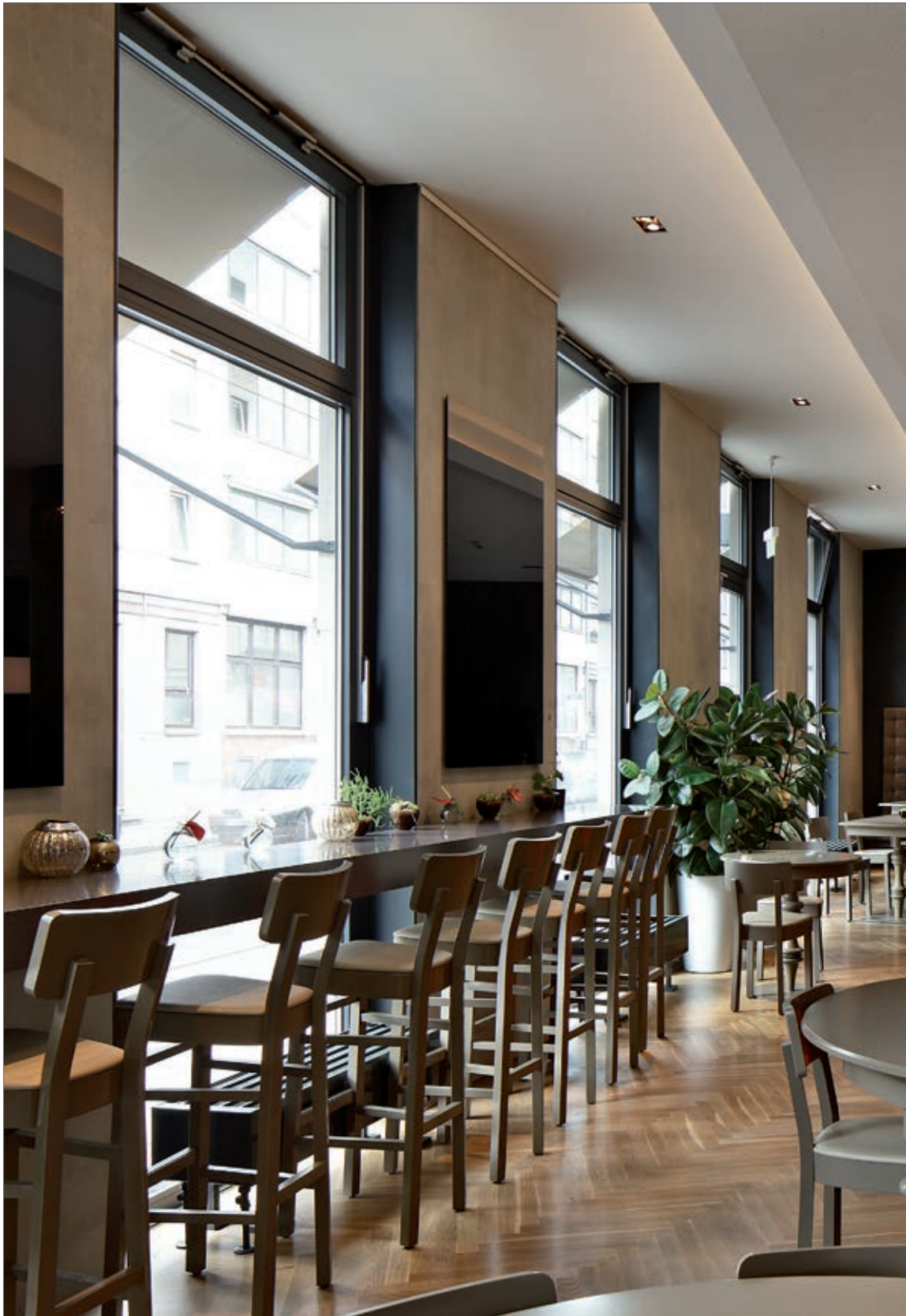
GEZE OL 90 N, Hotel Amano, Berlin, Germany