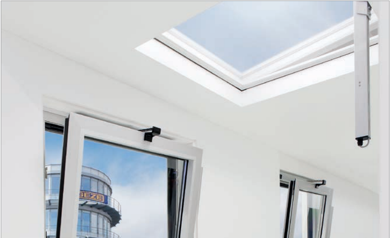
GEZE Slimchain and GEZE E 250 NT